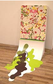
José Leon Cerrillo Eden, Eden 2002

The bulk of the show zeros in on two current art-world styles or clichés: hard-edged abstraction and photo-based representation. Of the abstract artists, none work in what could be called an "expressive," "gestural," or "wild" style. Color is cool or Pop-y and is applied in even, mostly opaque fields. An overall crispness predominates. facture is kept to a minimum; space is amorphous; lines, whether curved or straight, tend to be precise or lacy. Edges are deliberate; brush strokes,