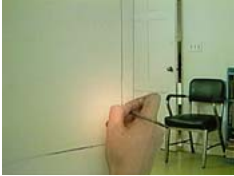
Ellen Harvey Seeing is Believing 2001

As for the representational painters (it's a shame to even have to talk about artists as "abstract" or "representational" when these categories are all but obsolete and the crossover between the two is so rich), the going formula seems to be: Take a photograph -- yours, an existing image, a snapshot, something from the Internet, etc. -- and simply reproduce it via a slide or opaque projector, tracing paper or whatnot. Whether the image is altered, blurred, or left intact, whether it's a portrait, a bedroom or a building, the lens is almost always irritatingly present.