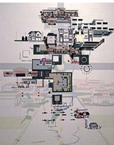
Benjamin Edwards The Monuments of Passaic 2002